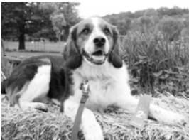
Winning Prizes at Dawg Walk

This year: We hope to give the animals another holiday to remember as they await their new homes.