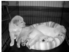
Sleepy pups at Puppies & Pumpkins