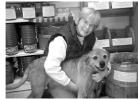
Buddy and Grace received the most votes during our Open House and were treated to a day of pampering