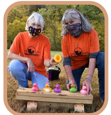
Volunteers making our Dawg Gone Walk & Fiesta a great success

Even though we weren’t able to see each other in-person as much as in past years, I (and our entire organization) still felt your support every single day. Whether it was via social media, email, phone calls or letters – you made sure to let us know you were still there. And, when we did get together, we accomplished great things! Despite the challenges, we were still able to safely hold all three of our major events in 2020, and they all exceeded our expectations.