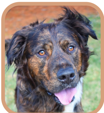
Baxter was just one of hundreds of dogs who found new homes in 2020

Through it all, I am so thankful to know that BCHS has your support to make it through whatever this year will bring. I hope you enjoy reading about the great things we accomplished this past year and I look forward to another outstanding year for the homeless pets in our community.