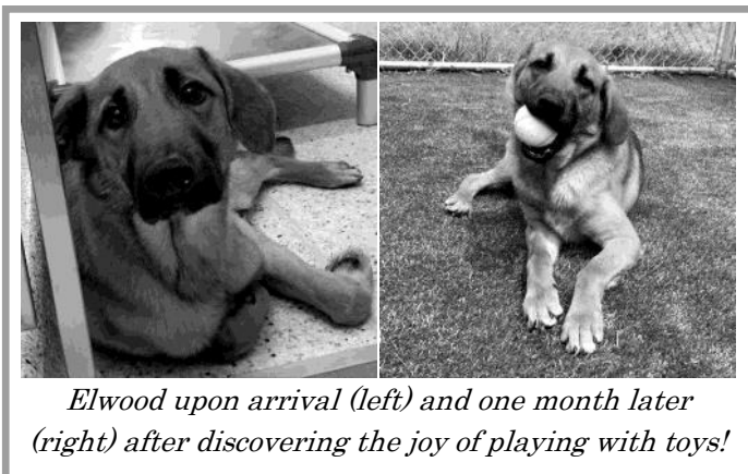
Elwood upon arrival (left) and one month later (right) after discovering the joy of playing with toys!

It has been one month since they arrived and all four are entirely different dogs. They have gained weight and gained confidence! Their favorite activity is puppy play time when they can run and tussle with each other in the big play yards. They all now approach caregivers and volunteers for attention (and, of course, treats!). All four have the biggest, goofiest smiles.