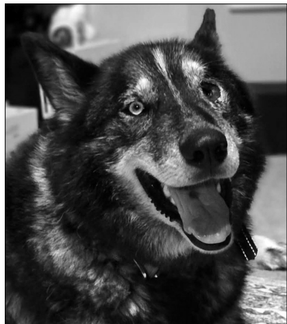
Coraline - 9 years old