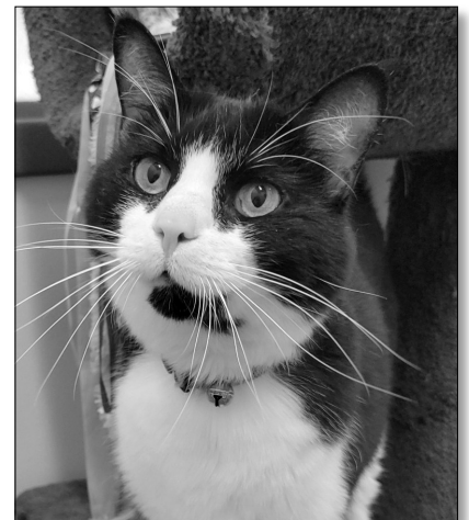
Siri - 8 years old