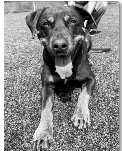
Triton - 9 years old

If you're ready to make a difference, consider adopting a senior pet. Stop by BCHS and meet the wonderful older cats and dogs waiting for their forever homes. They're eager to bring joy, comfort, and love into your life—you just have to say yes.