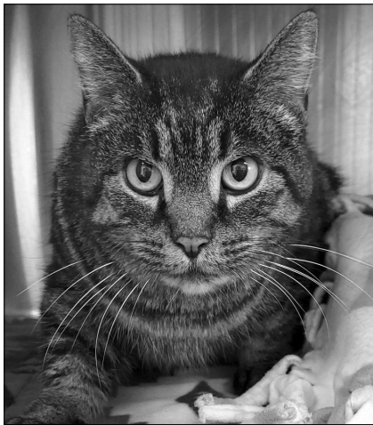
Garfield - 7 years old

Senior pets know the value of a second chance. They've experienced life, and when someone opens their heart to them, they return that kindness with deep loyalty and affection. The bond you form with an older pet is often immediate and incredibly meaningful.